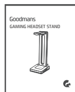
Quick Start Guide